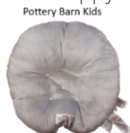
Pottery Barn Kids